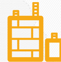
building materials cluster