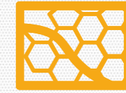
composite technology cluster