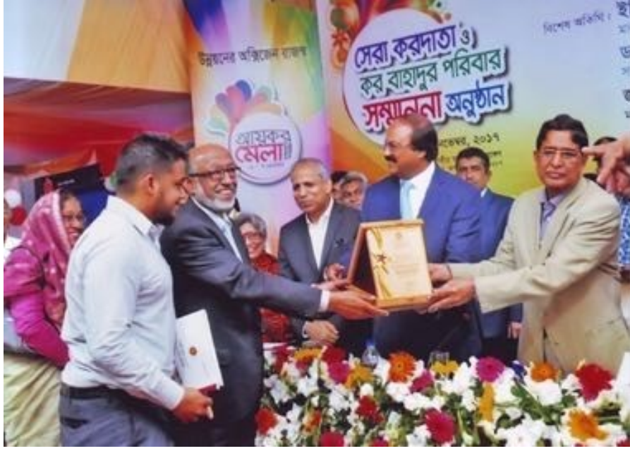
Pic: Receiving recognition from the Govt. of Bangladesh for “□□ □□□□□□ □□□□□□”