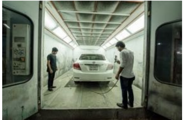
Paint work ongoing in fully equipped paint booth

No single automotive trader in Bangladesh has such comprehensive workshop and support engineering facilities at one place, which will cater all the technical needs of the customers. This facility is now being considered to be expanded and optimally used for other commercial/Industrial operations, like reconditioning of automotive vehicles, using the bonded house concept. Haq's Bay is also