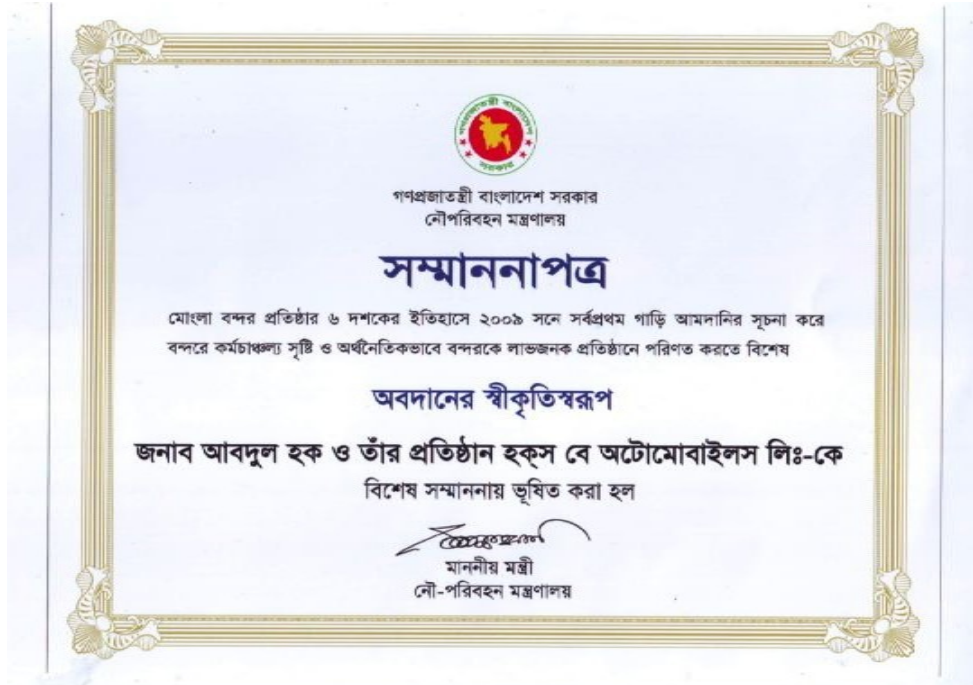
Pic: Recognition letter from the Hon. Shipping Minister of Bangladesh for exemplary role played in Reopening of Mongla Port