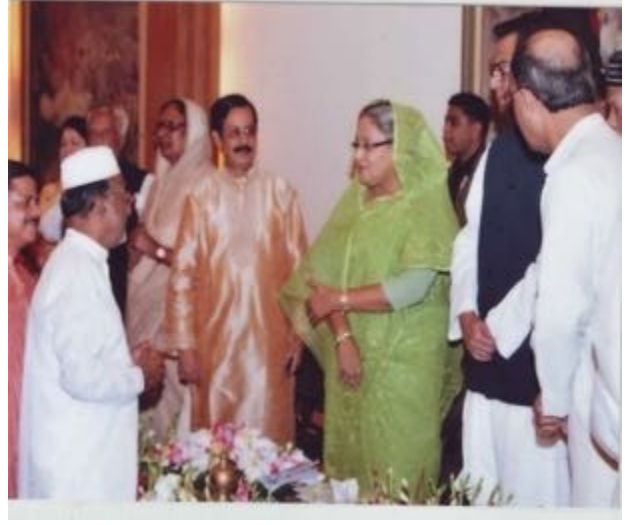
Pic: Exchanging pleasantries with the Hon. Prime Minister of Bangladesh, Sheikh Hasina