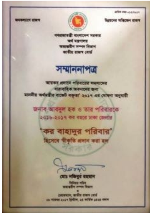
Pic: “□□ □□□□□□ □□□□□□” recognition from the Govt. of Bangladesh