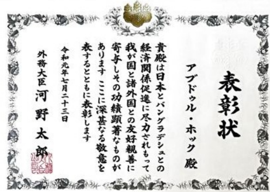
Pic: Left: PATENT OF DECORATION, The Order of the Rising Sun, Gold Rays with Rosette, as awarded to Mr. Haque; Right: CERTIFICATE OF COMMENDATION, as conferred to Mr. Haque by Mr. KANO Taro, the Honorable Minister of Foreign Affairs, Govt. of Japan